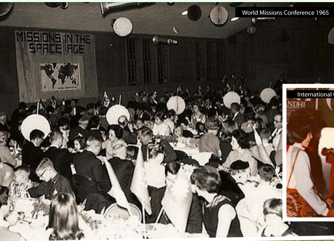
World Missions Conference 1965