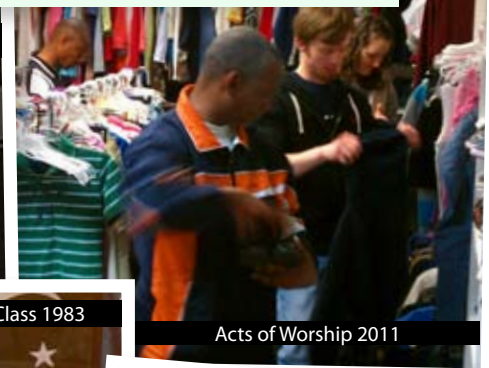
Acts of Worship 2011