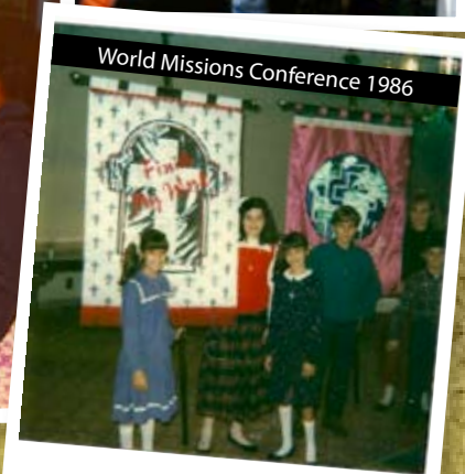
World Missions Conference 1986