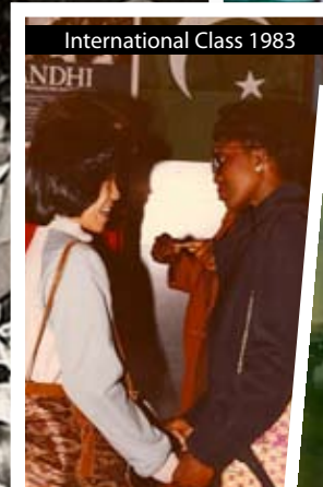
International Class 1983